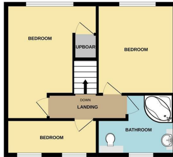
1ST FLOOR 463 sq.ft. (43.0 sq.m.) approx.